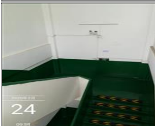
Photo of fire safety equipment Evacuation direction sign and emergency light.jpg