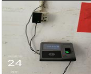
Photo of the inside of the main production hall Attendance recorder.jpg