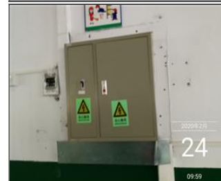
Photo of fire safety equipment Electricity box label.jpg