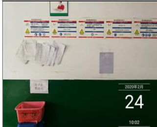
Photo of the inside of the main production hall Hazards notice.jpg