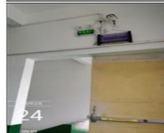
Photo of fire safety equipment Exit sign and emergency light.jpg