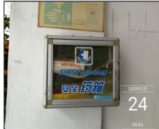
Photo first aid facilities First aid kit.jpg