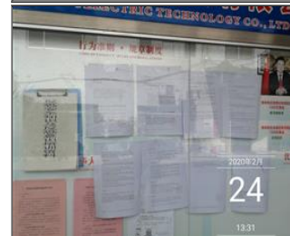
Photo of the code of conduct on display Posted amfori BSCI Code.jpg