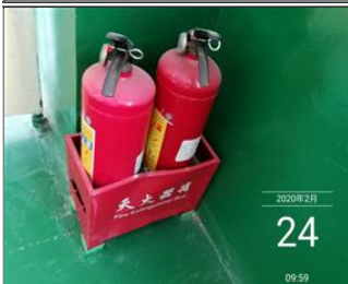
Photo of fire safety equipment Fire extinguishers.jpg