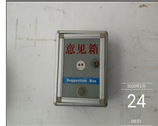
Photo of the inside of the main production hall Suggestion box.jpg