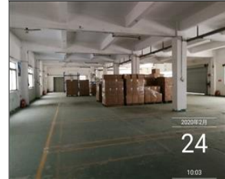
Photo of the inside of the main production hall Finished goods warehouse.jpg