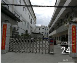
External photo(s) of the production unit(s) Facility gate.jpg