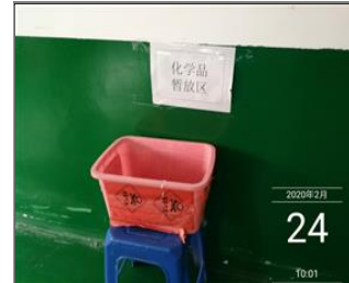
Photo of chemical storage room (if applicable) Chemical storage area.jpg