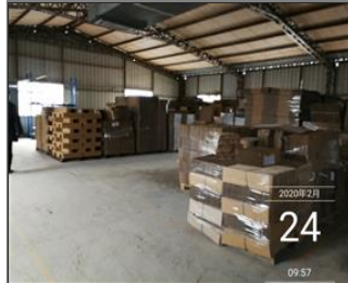
Photo of the inside of the main production hall Package material warehouse.jpg