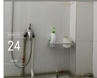
Photo of the sanitary facilities Liquid soap provided in the toilet.jpg