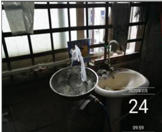
Photo first aid facilities Eye washing facility.jpg