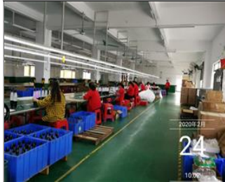
Photo of the inside of the main production hall Assembly and packing.jpg