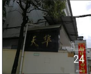
External photo(s) of the production unit(s) Facility name.jpg