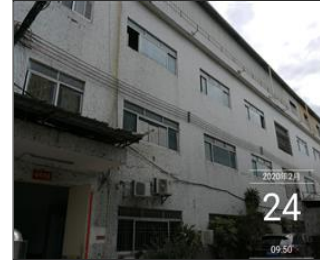
External photo(s) of the production unit(s) Production building.jpg