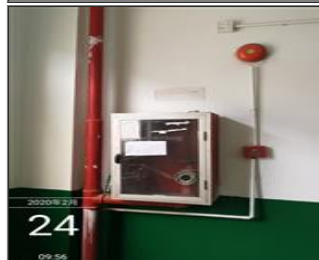
Photo of fire safety equipment Fire hydrant and fire alarm.jpg