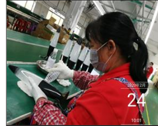
Photo of the personal protection equipments (if applicable) Employee with PPE.jpg