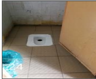
Photo of the sanitary facilities Toilet.jpg