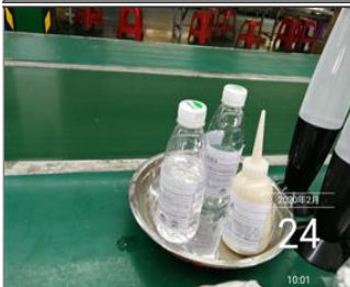
Photo of chemical storage room (if applicable) Chemical with safety label.jpg