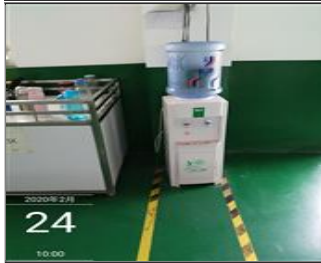
Photo of the sanitary facilities Drinkable water.jpg